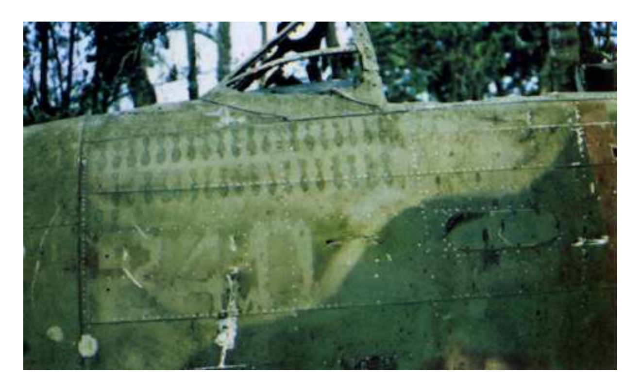
Picture 1: The wreck of the ex MLD Boston AL907/A28-8, recovered in Goodenough Island in 1987. On the nose the number 240, the 240<sup>th</sup> and last aircraft of the original French order, applied for publicity reasons by Douglas, is still visible.

the Netherlands East Indies. The Americans made much haste with the delivery and allowed Douglas to begin preparations for shipment to the Netherlands East Indies even before the official contracts had been drawn up and the Commander-in-Chief of the US Air Corps had received formal permission from the Under Secretary of War for the transfer of the 32 aircraft. He did not get it until 26 January 1942, whereas Air Corps Ferrying Command had received orders as early as 27 December 1941 to begin airlifting the DB-7Bs to Douglas at Long Beach municipal airport, California. The formal transfer ("acceptance") of the aircraft was done at the Douglas factory by a representative of the Netherlands Purchasing Commission (NPC) in New York. The aircraft had to be paid for in cash after delivery. [1]