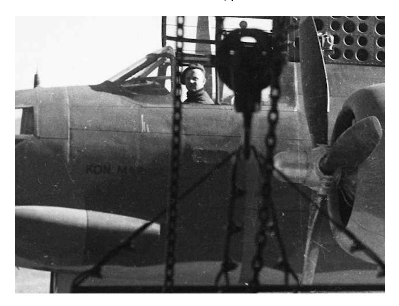
Picture 2: In 1942 there were still many DB-7Bs flying in 22 Squadron RAAF with the lettering KON.MARINE on the nose.

D serial number of the MLD had been applied. It is not known whether these aircraft were already fitted out with the metric instruments mentioned above. [3]