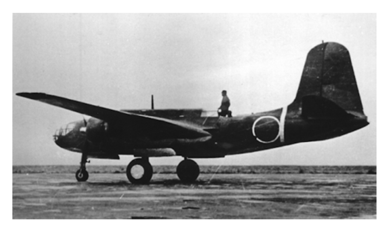
Picture 6: The flight-ready DB-7B the Japanese captured completely intact at Andir, photographed at Tachikawa, the test centre of the Japanese Army air force in the middle of 1942.

was all but ready for its first test flight and fell into Japanese completely intact. [41] The other Bostons at Bandoeng were approaching completion and were thoroughly destroyed in the afternoon of 7 March 1942 by the MLD assembly team in view of the capitulation of the KNIL which was expected to come at any moment now. For good measure, a hand grenade was thrown into the cockpits [42] and these aircraft were later classified as wrecks by the Japanese. [43]