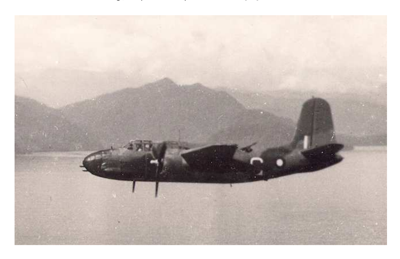
Picture 7: The Boston AL897/A28-6 "G" of 22 Squadron RAAF flying off the south-west coast of New Guinea, on its way back from a mission in 1942.

Boston went to the aero technical arsenal of the Navy air force at Yokusuka for evaluation. Its registration was Ko-DA-1. [52] The fuselage of the aircraft ended its existence as a technical instruction airframe at Atsugi, a Japanese Navy air force base. [53]