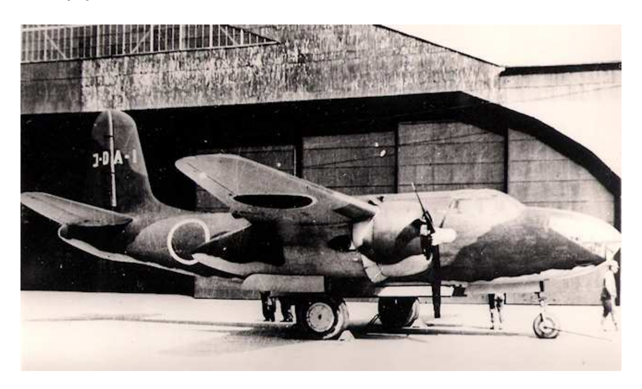
Picture 5: The Boston AL904, still in crates at Tjilatjap, fell into Japanese hands and was later flown over to Japan. This picture was taken in late 1942 at Yokusuka, the site of the test centre of the Japanese Navy air force.

After an inspection by the divisional commander of the KNIL on 6 March around noon, the harbour was closed at around 14:00 hrs that day, and Tjilatjap was subsequently evacuated by the troops. [34] The role of the harbour was over and the majority of the KNIL troops, along with the British anti-aircraft artillery units, left in the late afternoon and evening. This was in part due to the rapid Japanese advance through Central Java in the direction of Tjilatjap. Materiel that could not be taken along had to be destroyed on the spot. [35] In accordance with the orders of the divisional commander, the Commandant Maritieme Middelen also ordered part of his personnel (including a number of service personnel coming from the assembly team) to leave Tjilatjap in the afternoon of 6 March. [36]