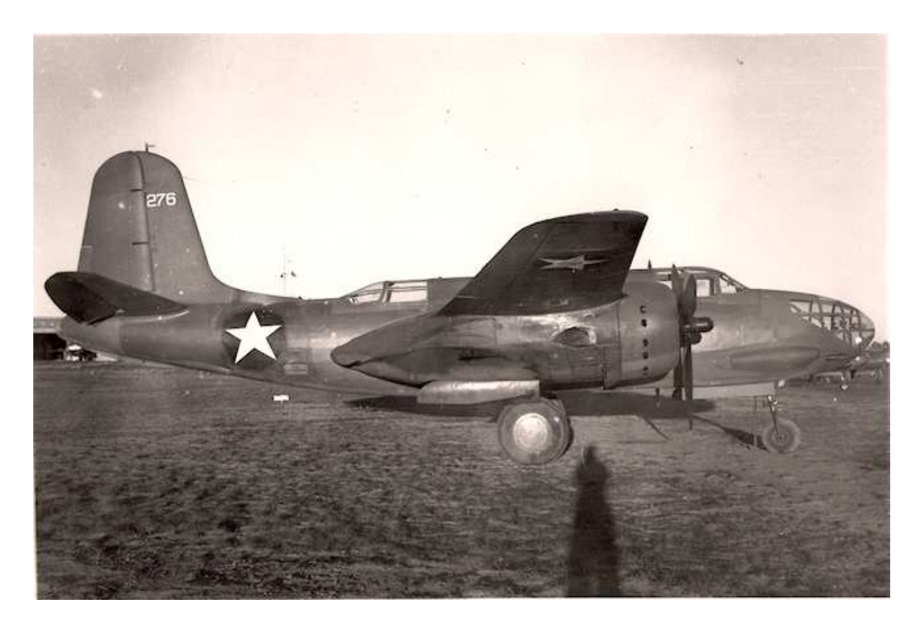
Picture 8: One of the Douglas A-20A aircraft of 18 Squadron NEI at Canberra in June 1942 (J. Schellekens).

In the first instance, No 18 Squadron NEI was to receive eight DB-7Bs from the reserve for 22 Squadron and seven A-20As from the USAAF, and later a further three A-20As. [57] In spite of the objections put forward (also on the political level), the 15 Bostons did arrive, the DB-7Bs on 7 and 8 June and the A-20As on 12 and 13 June 1942, while the B-25Cs were to be handed in. However, on 14 June 1942 the exchange was cancelled. The Bostons were still used for a few days for training purposes, the last time on 22 June 1942. [58] The final ten aircraft, among which were the eight former MLD Bostons, were handed over to the commanding officer 22 Squadron RAAF, who subsequently flew the planes over to Melbourne with several of the pilots of his squadron. [59] The A-20As went to 8 Squadron of the 3<sup>rd</sup> Bomb. Group (Light) of the USAAF, the DB-7Bs were once again destined to go to 22 Squadron RAAF or stayed at Melbourne as reserves for this squadron. [60] The story of the Douglas DB-7B aircraft in the Netherlands East Indies military service had come to an end.