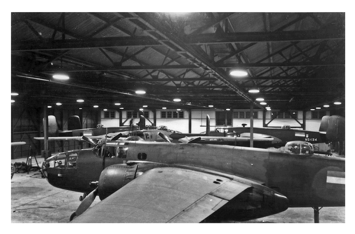
The five B-25Cs initially assigned to 18 Squadron NEI in the squadron hangar at Canberra during April or May 1942 with in the back aircraft 41-12464/N5-134 and with its nose to the camera aircraft 41-12501/N5-161