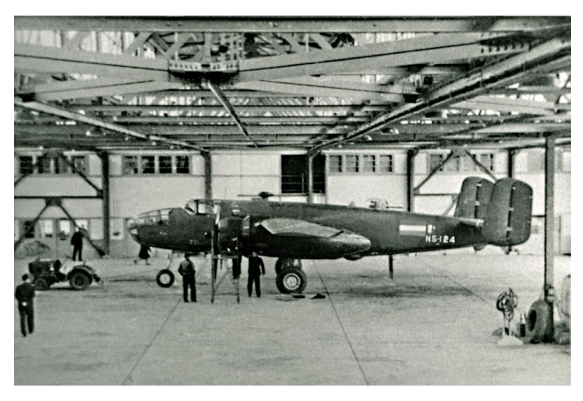
B-25C No N5-124 (ex N5-136) photographed in the hangar of 18 NEI Squadron at Canberra around July 1942

The protests along diplomatic channels worked and eventually the Chief of Staff of General MacArthur informed the NEI Headquarters in Melbourne in a carefully drafted letter dated 14 June 1942 that eighteen B-25s were to be delivered. The project was called Project Mark I and re-equipment of 18 Squadron with eighteen B-25C and B-25D aircraft not belonging to the original NEI Defence Aid assignment should start in July 1942. The five aircraft assigned to 18 Sq NEI were to be returned to the USAAF. The USAAF suddenly showed good will and transferred a sixth B-25 (the repaired 41-12494 becoming N5-127) which arrived at Canberra around 21 June 1942. This aircraft was possibly an exchange for the salvaged 41-12476. [51] During August 1942 the first of the new B-25s (registered N5-128 up to and including N5-145) were finally received. Although these aircraft were equipped with the rather rudimentary D3A Estoppey bombsight, replaced by the ML on its B-10 bombers in 1937 already, 18 Squadron NEI soon became a very efficient medium-bomber unit operating in the Darwin area under operational control of the RAAF. Former NEI B-25s were put to good use some months earlier. The 3rd Bombardment Group (Light) flew B-25 operations from 5 April 1942 but suffered severe losses. [52]