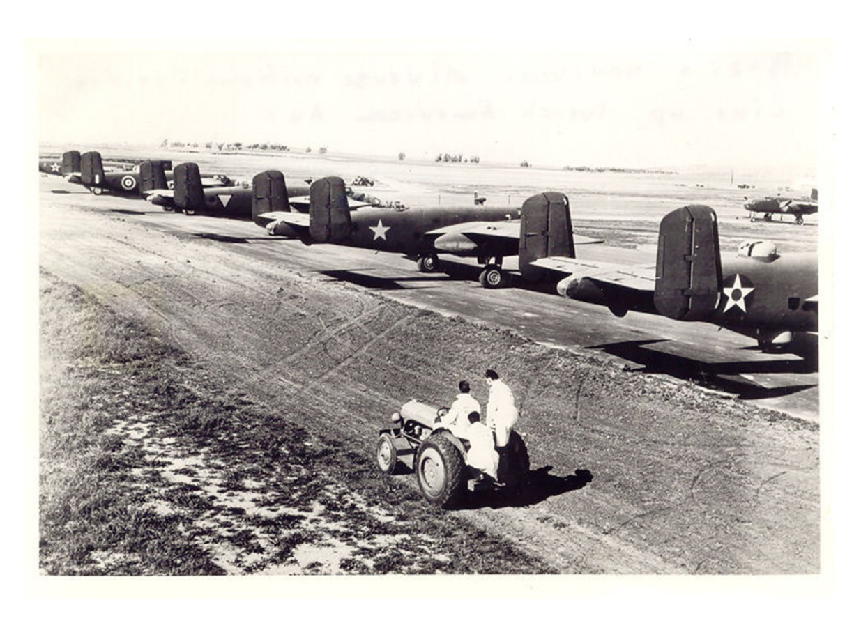
Publicity shot of the flight line of the Chicago & Southern Airlines Modification Center, showing B-25s for the USAAF, NEI, Russia and Great Britain. The censor has removed the Air Corps serials on the tails of the aircraft

All of the (priority) deliveries of B-25C and C-5 aircraft against the original contract were cancelled, with none delivered to the ML yet, during the second half of March 1942. This was a purely administrative matter as Materiel Command USAAF introduced a new system of allocations per production block from 1 April. Allocations of new production aircraft were now to be done by the Munitions Assignment Board, MAB, an advisory body to the Combined Chiefs of Staff. This board quickly reassigned to the NEI 101 B-25Cs (following the original delivery schedule but deleting the thirteen aircraft of March) and added one extra B-25D. These new assignments were later reduced, cancelled and replaced by other assignments several times. For the year 1942, eventually, only ten (still NEI owned on paper) B-25C-5 aircraft were assigned and delivered to the NEI for use at the Royal Netherlands Military Flying School at Jackson (Mississippi). At the time of the policy change nearly all the NEI-DA B-25Cs were already delivered by NAA, however. [5]