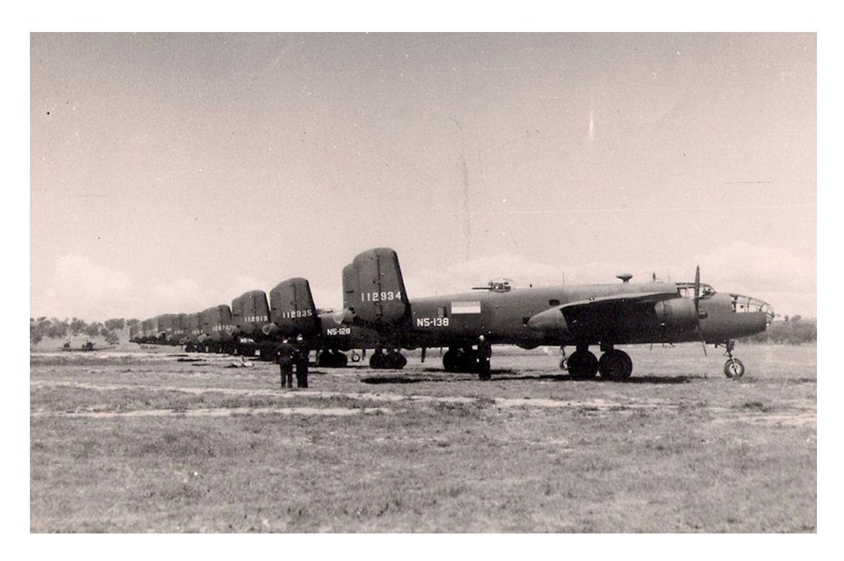
Project Mark I Mitchells of 18 Squadron NEI at Canberra during September 1942