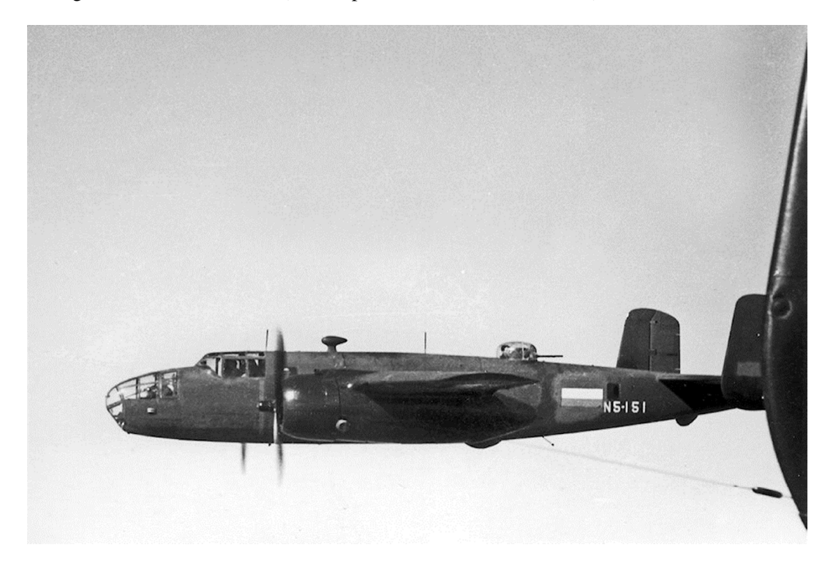
Mitchell No 41-12482/N5-151 was received at Archerfield on 29 March 1942. The photograph was taken in April or May 1942 during a training flight from Canberra

Of the remaining three B-25s one crashed in Africa (to be paid for by the NPC) and two were damaged at Palm Beach West (to be repaired at the cost of the NPC)