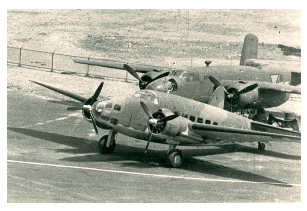
Mitchell No 41-12457/N5-125 at Dorval airport of Montreal, Canada where it was in use for the transition training of ferry crews of RAF Ferry Command together with the Lockheed Hudson bomber parked in front of the aircraft