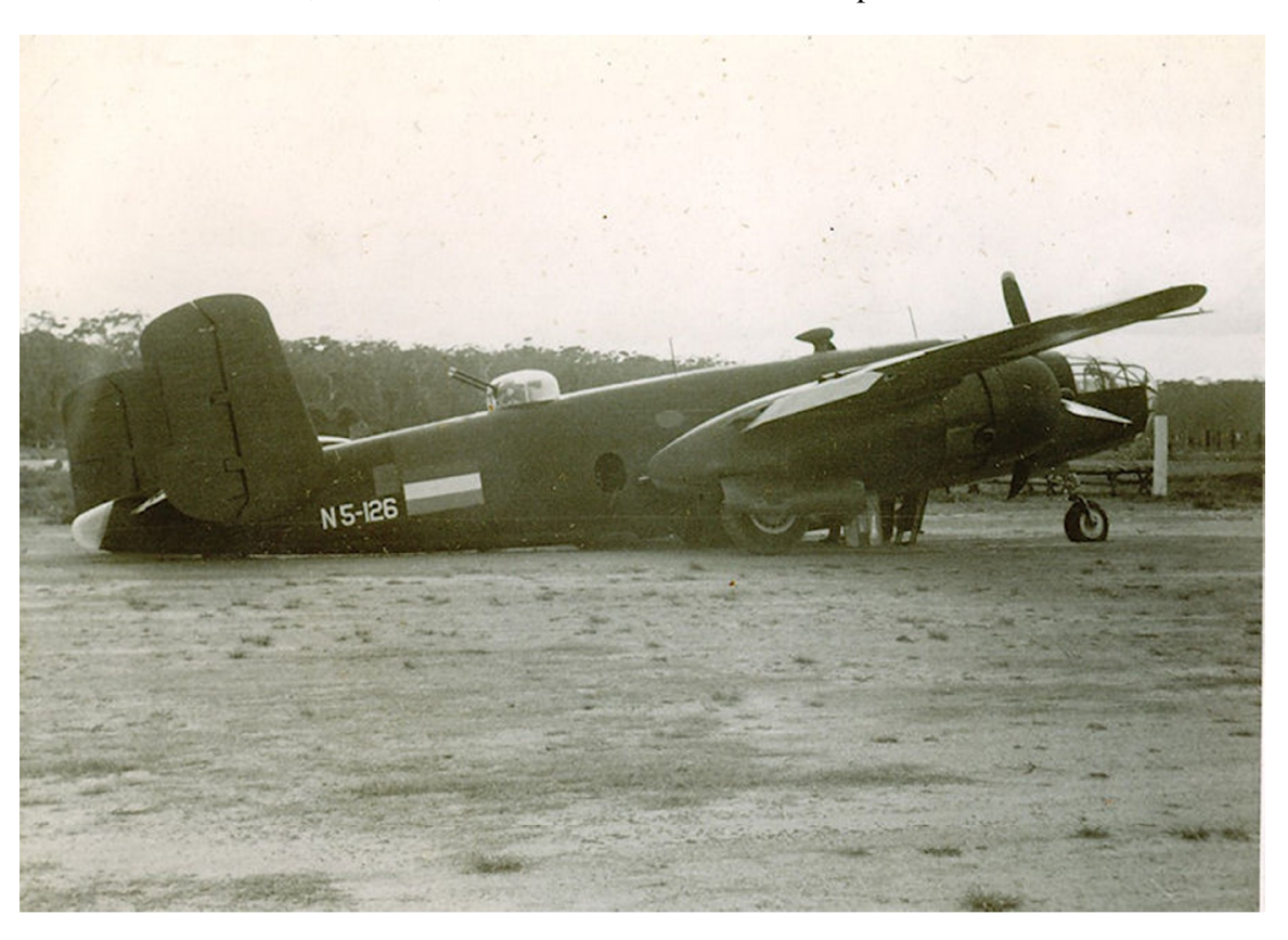
Aircraft No N5-126 (formerly N5-161) of 18 NEI Squadron after a crash on Moruya airstrip on 21 July 1942

Summarising the above, the USAAF took over from the ML "on loan", that is the aircraft to be replaced from new deliveries at a later date, 17 B-25s during March and April 1942. One of these 17 B-25s was, however, considered a write off at the expense of the USAAF.