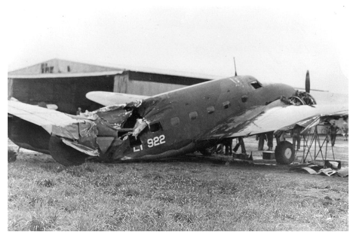
Lodestar LT922 of the ML was one of four Lodestars used to transport the ML Det Archerfield. It was hit when parked at Archerfield by an Australian DC-3 during taxiing in the night of 17 and 18 February 1942 when the DC-3 pilot had to use the brakes on the wet grass surface of the airfield. The accident portended little good for the future B-25 operations

On 8 March the KNIL and allied forces on Java capitulated (effective the next day) and, consequently, on 9 March the ferry to Australia was put on hold. Ten aircraft were already scheduled to leave on the latter date or shortly after but their departure was cancelled and the B-25s already at Hamilton Field were flown back to Sacramento. Air Corps Ferrying Command gave clearance to resume the ferry flights to Australia on 13 March and the first two B-25s left that same day. The aircraft were now to go to a NEI unit to be formed at Archerfield. Next to arrive at Archerfield were: