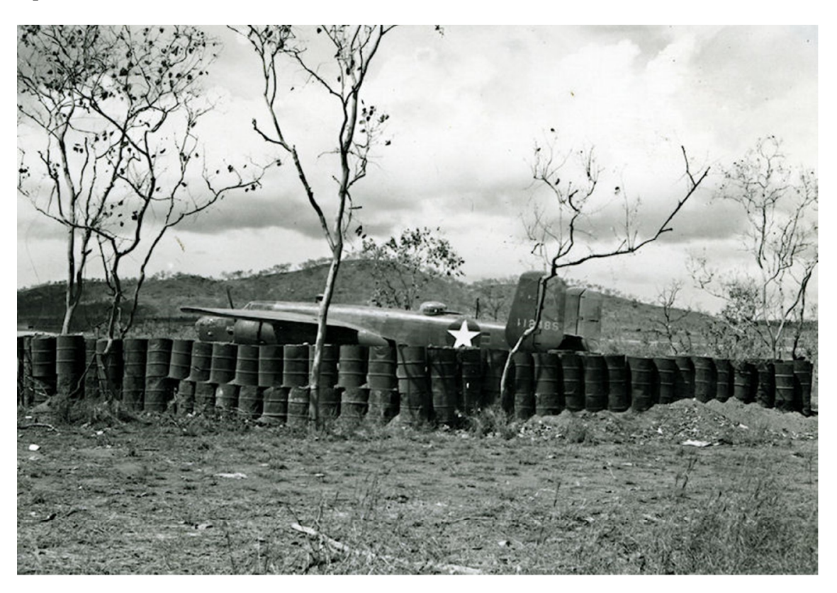
Former ML Mitchell No 41-12485 of 3 BG (L) photographed at Port Moresby around January 1943 (official USAAF photograph)

Groups of personnel of 3 BG arrived at Archerfield on 25 March, 27 March and 1 April and took over the 12 B-25 initially transferred, followed by the three that arrived in the period of 28 March up to and inclusive 2 April. Personnel of the Air Depot painted American insignia on the B-25s and painted out the N5 serials of the ML. Jack Fox gave a briefing on the B-25 and its systems and after studying the Technical Orders and check outs by ML personnel the 3 BG crews, mostly trained on Douglas A-20 light bombers in the US but including some former Douglas A-24 single engine pilots (however, with some twin-engine experience), left for their base Charters Towers near Townsville. Departure was on 29 March, 30 March and 3 April 1942, with a total of 15 aircraft.